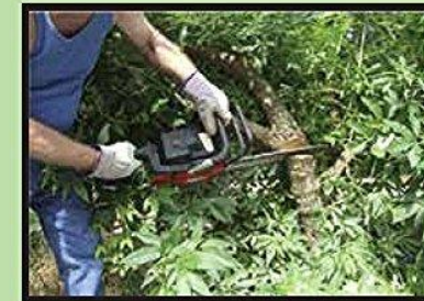
Cut Back Plant