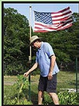
Safe on windy days

No protective clothing or equipment needed.